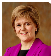
NICOLA STURGEON MSP First Minister of Scotland

Indeed, in the hours after the EU referendum result I made clear to EU nationals "Scotland is your home, you are welcome here, and the contribution that you make to our economy, our society and our culture is valued."