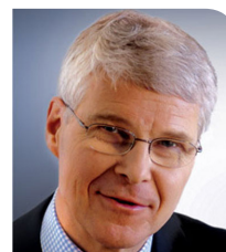
HENRIK LAX MEP 2004 – 2009 Finland

Who will be the visionary leader showing to the Europeans how they can make Europe great again - or will there be any one? ■